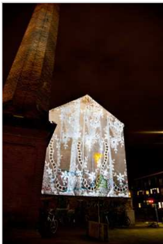
Pieces of lace projected on the gable outside Brandts Klædefabrik.